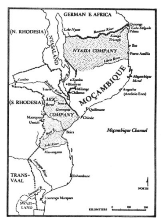
Map 3: Mozambique on the eve of the First World War. The map locates the capital, Lorenzo Marques, and the territories held by the Nyassa Company.

neighbors." Lourenço Marques had long been seen as a desirable point of access to the sea by Transvaal.