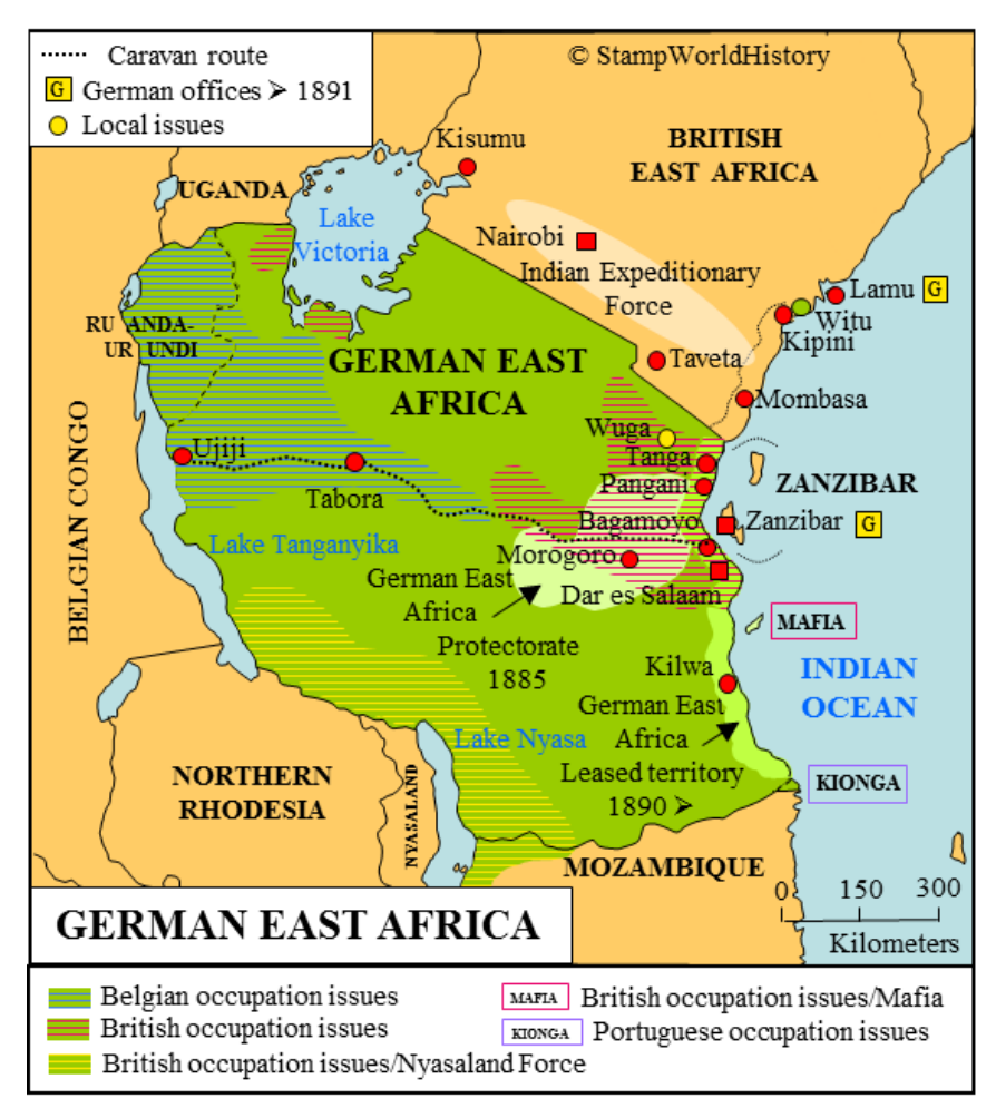
Map 2: German East Africa c. 1914.

Immigration from western India into East Africa was sizable and encouraged informally by Indian employers and British agents. The German and British railways, inland shipping, postal and telegraph corporations, banking and government administrative developments brought hundreds of Goanese men to East Africa where, by 1911, their wives and families had begun to join them in the city coast, notably in Zanzibar, Mombasa, Tanga, and Dares-Salaan. Indian emigration to East Africa was incentivized and even encouraged, informally, by both the Indians and the British (Hawley, 2008). During the Anglo-Boer War, the British commander, Lord Roberts, had requested permission from the Portuguese government for his forces to cross Mozambique in order to facilitate an attack on the Transvaal from the north. Many Boers, as a result of this conflict, eventually settled in Mozambique, where they remained even after peace was restored.